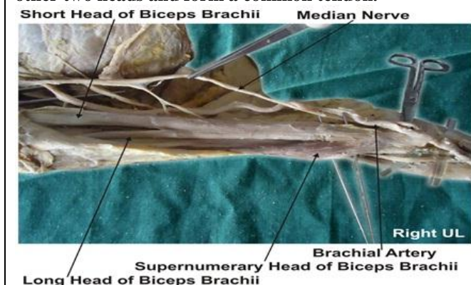
Figure 1 showing the photographic presentation of the supernumerary head of biceps brachii joined with the other two heads and form a common tendon.